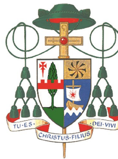
Marriage & Family Life Office